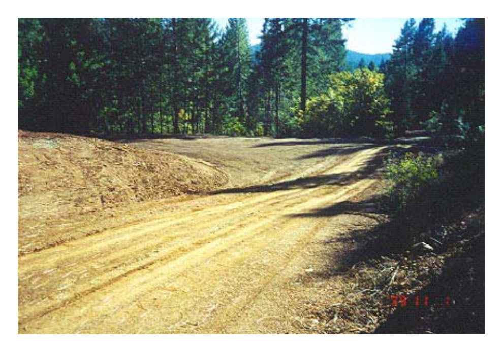
A potential spoil disposal site identified in the County Road Erosion Inventory