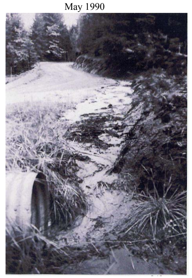
A. <u>Before</u> – Insloped, unsurfaced road on decomposed granitic soils with heavy sediment runoff