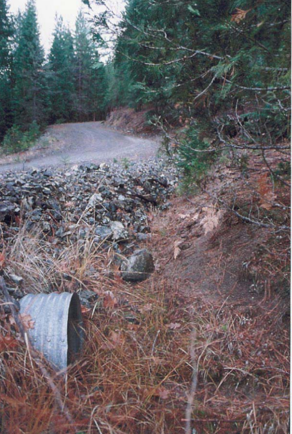
B. <u>After</u> – Outsloped, rocked road with no sediment runoff to culvert and into stream

Road treatment completed in Spring 1991 and sustained with minimal maintenance.