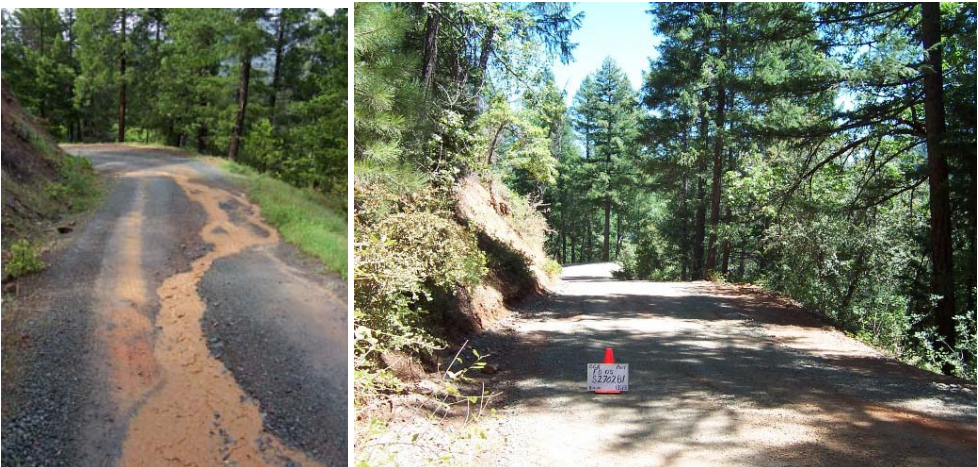
Above left pre-project ditch diversion down the road. Above right post project outsloping, ditch removal and rolling dips drain water across the road rather than down it. Below pre-project culvert misaligned and directed into bank was replaces with a proper aligned and larger culvert

China Gulch Road in the Rush Creek watershed identified 7 'Sites', or road-related sediment sources that could deliver 1,374 yd3 over a 10-year period. Given that there was active erosion or ditch and stream flow diversion occurring at each site, all sites were given a high priority for implementation.