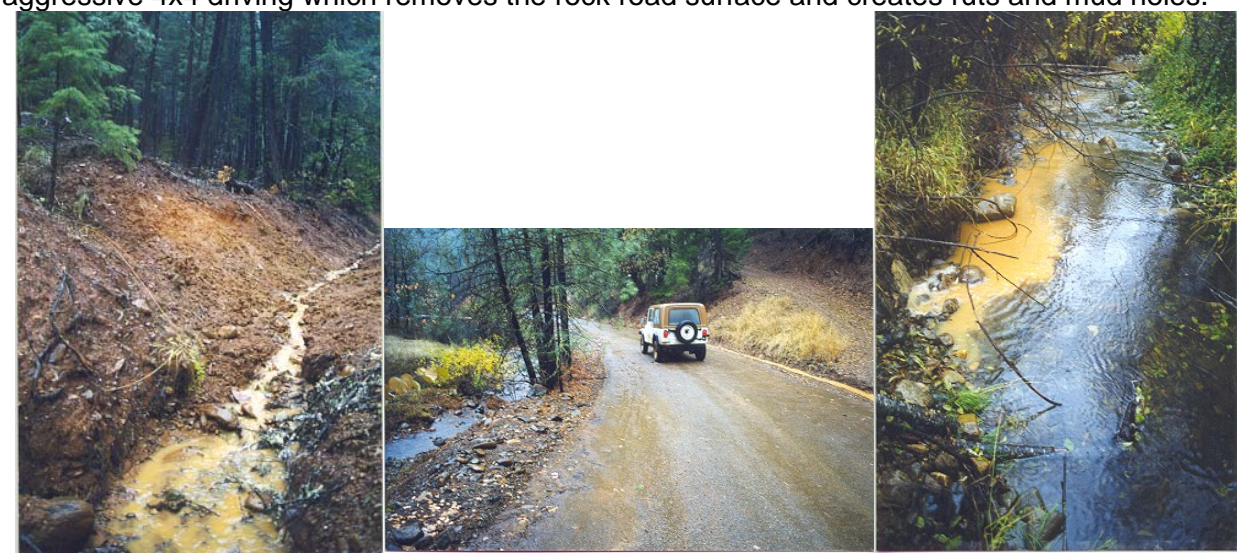
Above Left diverted Class III streams erode the ditch, road and hillslope. Turbid runoff from the road contrasts with the flow in China Gulch Creek stream (Middle) and the effect China Gulch Creek as it flows into Little Browns Creek (Right).

China Gulch Road was one of the early County roads, connecting Weaverville and Minersville (now flooded by Trinity Lake). Construction of Highway 3 and Rush Creek Roads truncated the original road, leaving only a 2.5 miles remnant section that has limited public value (fire and forest access). Prior to restoration work, it was poorly drained and contributed significant amounts of sediment to Weaver Creek from road ditch diversions, stream diversions, and bank slumps during large storm events (refer to photos below). Upgrades of the Weaver Creek side of the road (southern half) in 2001 minimized road related erosion and demonstrated the benefit of similar work on the remainder of the road. Current road issues in that area are due to aggressive 4x4 driving which removes the rock road surface and creates ruts and mud holes.