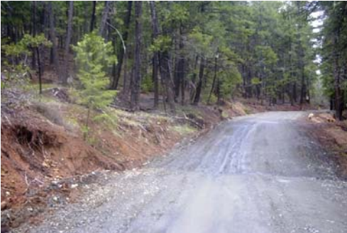
Outsloped segments of the south side of China Gulch Road repaired in 2001 reduced bank slides, ditch down cutting, road gullying and fill failures. There has been no maintenance on this road in the intervening nine years except for slide removal at Site 2464.1

China Gulch Road is a very low-use road that accesses SPI and National Forest lands, there are no homes or other private lands accessed from this road (except for two homes on the paved segment at the southern end of the road). Garbage dumping and illegal firewood harvesting are constant problems on this remote road.