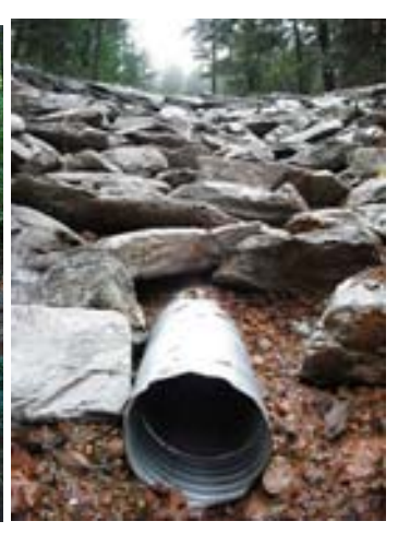
Prepared By: Five Counties Salmonid Conservation Program