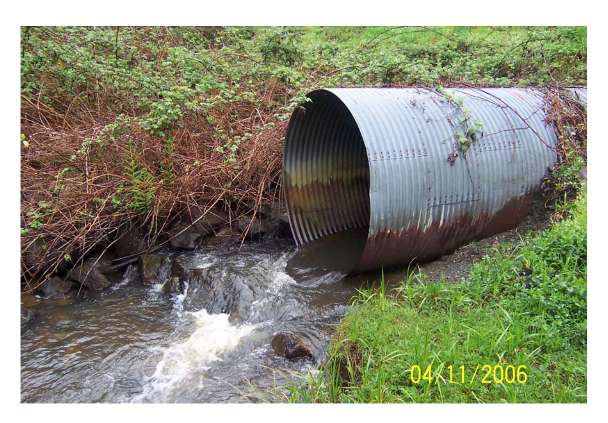
Figure 3 – Migration Barrier Yonkers Creek Outlet