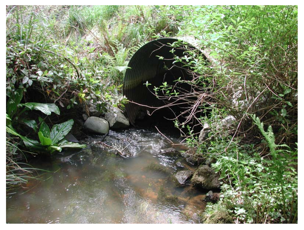
Figure 4 – Inlet of Yonkers Creek