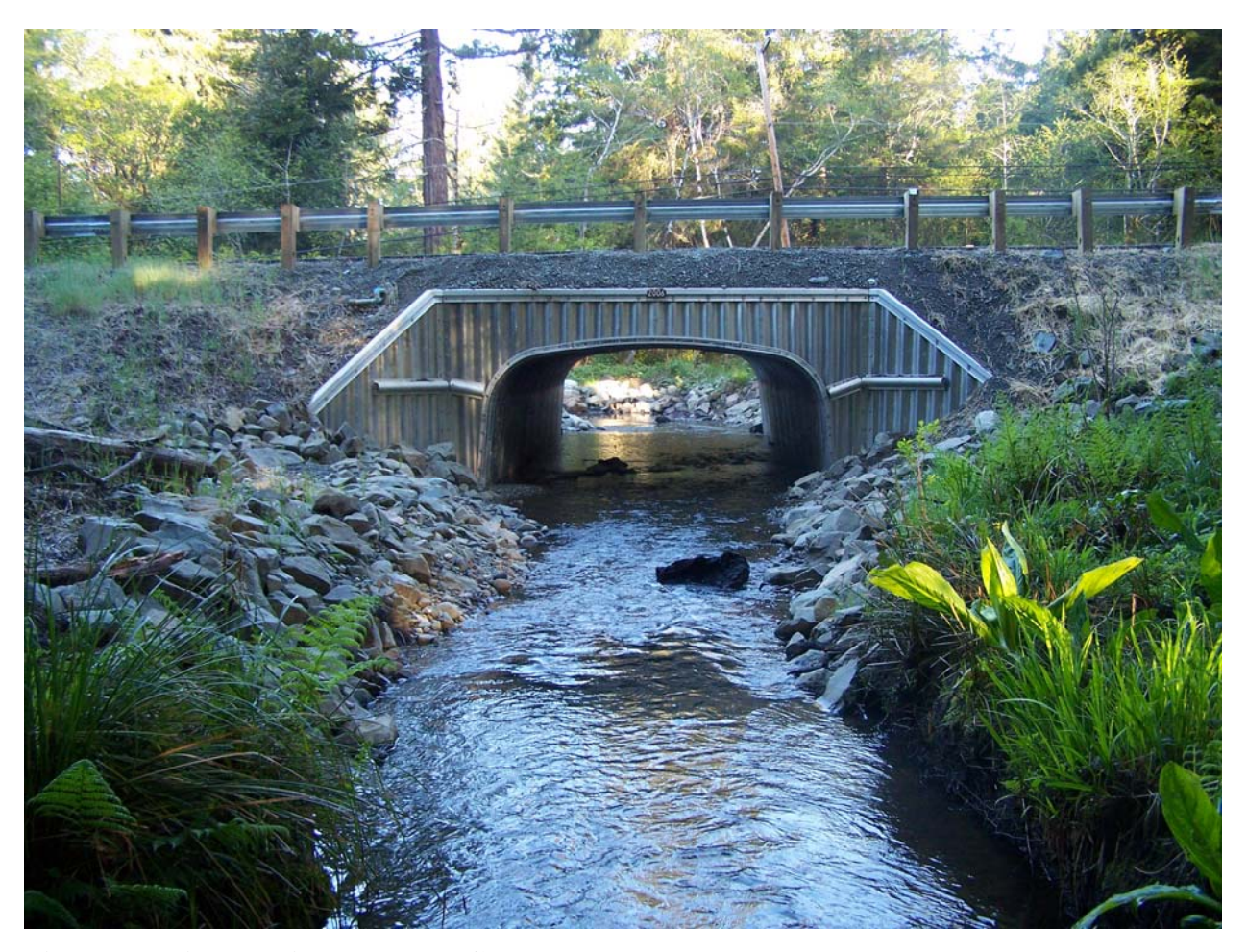
Figure 5 – Final Project Yonkers Creek