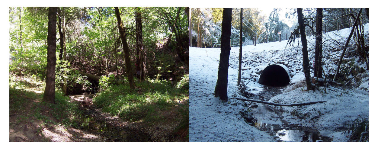
Rhine Driveway Project before with 5' corrugate metal culvert looking upstream (left) and restored channel with 14' wide multi-plate arch culvert (right).