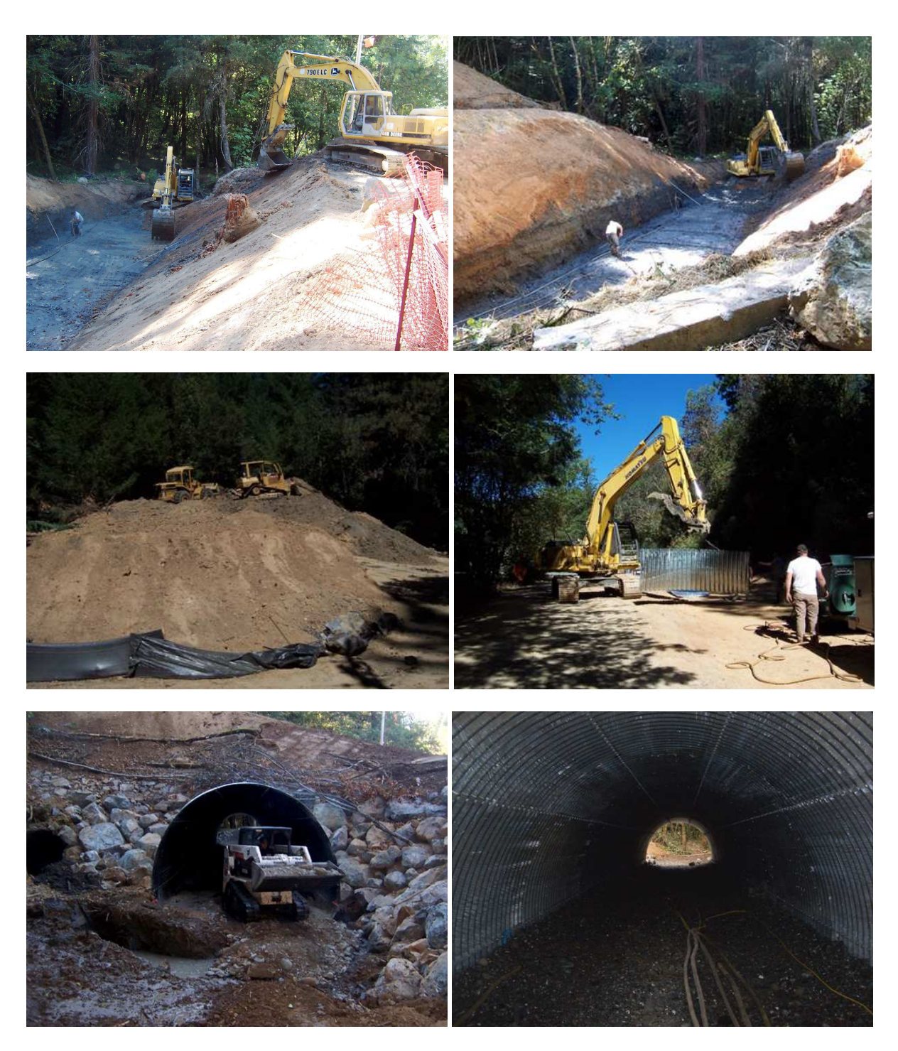
Upper Left- Digging below stream grade to set arch. Upper Right- The creek bed was dewatered and culvert alignment and grade set. Middle Left- Managing the spoils pile. Middle Right- Unloading the arch pieces. Bottom Left- Filling the stream bottom with material. Bottom Right- Streambed in place.