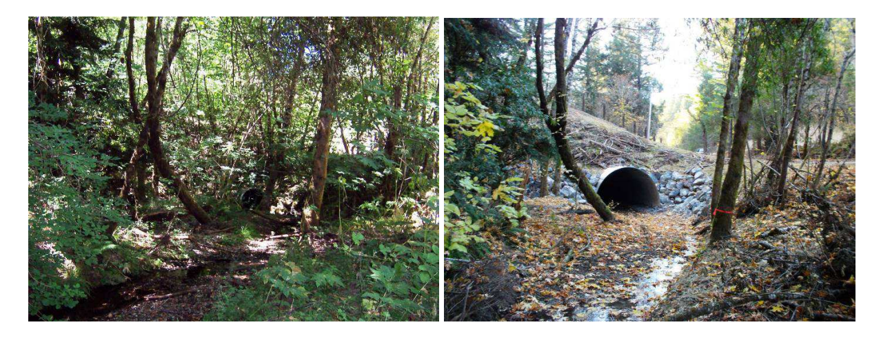
Rhine Driveway Project before with 5' corrugate metal culvert looking downstream (left) and restored channel with 14' wide multi-plate arch culvert (right).